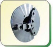
● 三爪強力夾頭 3-Jaw Scroll Chuck