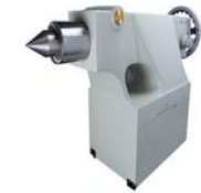
● 強力尾座 Heavy Duty Tailstock