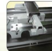
● 斜度裝置 Taper Turning Attachment