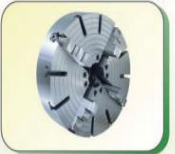
● 美式四爪夾頭 4-Jaw Independent Chuck