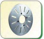
● 面盤 Face Plate