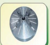
● 英式四爪夾頭 4-Jaw Face Chuck