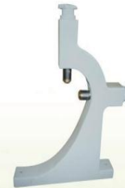
● 跟刀架 Follow Rest