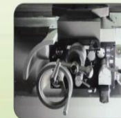
● 四方向快速裝置 4 Way Rapid Traverse Device