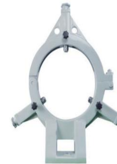
● 中心架 Steady Rest